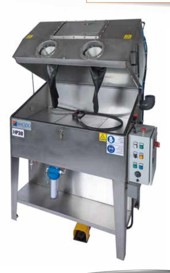
Manufactured in 304 Stainless Steel

MAGIDO HP (High Pressure) parts washers are designed to quickly blast your parts clean using a high pressure spray wand and aqueous detergent.